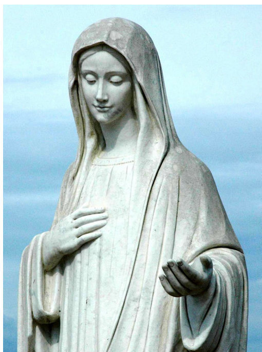
Statue of Mary at Medjugorje

In this month of May, let each of us begin to answer Blessed Mary's call through prayer of a daily rosary, attending daily Mass, fasting every Wednesday and Friday, monthly confession, loving one another, smiling and having faith. Our Lady's love is unconditional: she loves the sinner, the atheist, the unbeliever. Our Lady believes in and loves YOU!