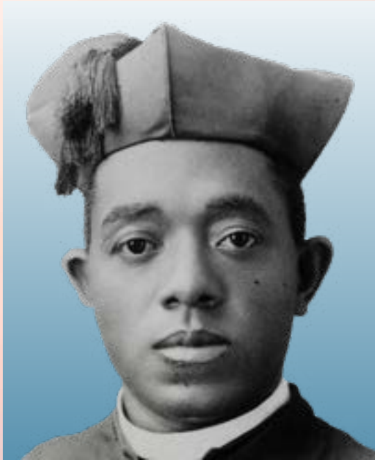
Venerable Father Augustus Tolton