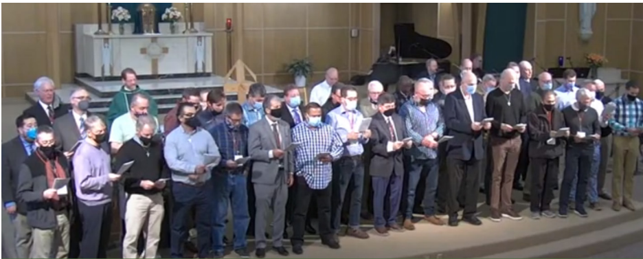
October 17, 2021: The ACTS Men sing at the Sunday 11am Mass.