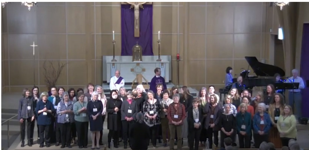
March 13, 2022 - The ACTS women's team and retreatants sing at 11am Mass.