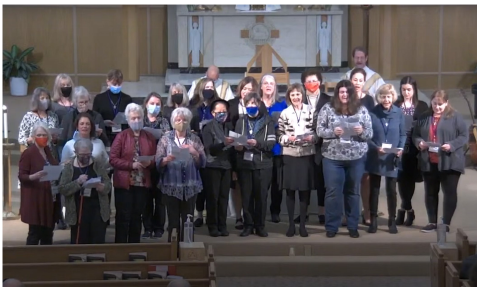
The 2021 Women's ACTS retreatants sing at the 11am Mass on Nov. 21, 2021.