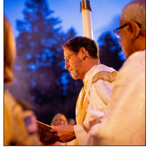
EASTER VIGIL 2022

The Body of Christ Cannot be Livestreamed: To receive the Real Presence of Jesus in the Holy Eucharist is impossible