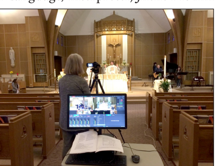
INITIAL RECORDING SETUP IN APRIL 2020, AMID THE PANDEMIC

for the Catholic Deaf Community who were scheduled to join us for Mass that weekend. It was a first for us and initially took many hours each weekend to edit and upload the video to our website until our livestream camera system was