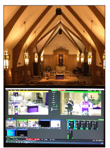
CURRENT LIVESTREAM SETUP IN THE CHOIR LOFT (PHOTO TAKEN DEC. 2020)

Now that most parishioners can attend Mass in person, we are using this occasion to make additional changes to our weekend livestream Mass schedule. Our Saturday 5 PM